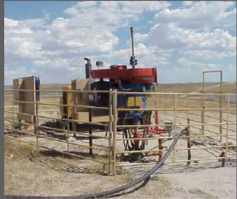
Progressing cavity pump with generator (behind) used for dewatering a CBM well